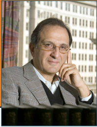
DR. JAMES ZOGBY, PRESIDENT AND FOUNDER OF THE ARAB AMERICAN INSTITUTE

The Arab immigrant communities we serve at the Arab American Institute have been confronted with the effects of NSEERS from the beginning of the program and continue to feel its consequences. Right in the beginning, we called the Dallas office of the INS [in charge of NSEERS before the creation of DHS] and asked, "Are you sending out notices of information to people?" and they said, "Yeah it's all taken care of." We said that we have talked to our people in Dallas, but they have not heard anything from you. INS responded and said "Oh no, that's not true, we have talked to the Arab community." INS stated that they had a group of women in, and they had veils on so they knew they were Arab. We then asked them what about the name of the group. It turned out that it was some Pakistani medical association, so obviously the INS officer did not know that Pakistanis are not Arabs and that not all Arabs are Muslims and just by [talking to someone] wearing a head scarf does not mean that you talked to the Arab community.